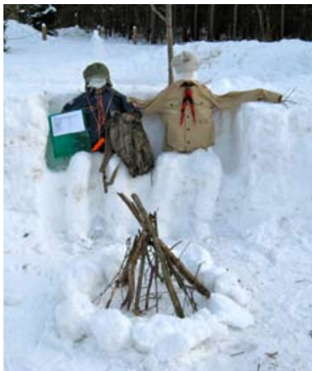
Sam Case (10th) made this cool snowmen structure of 2 boyscouts reclining by the fire.